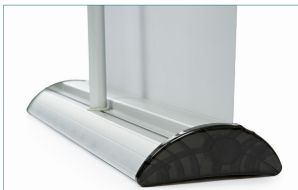
Twin feet for good stability