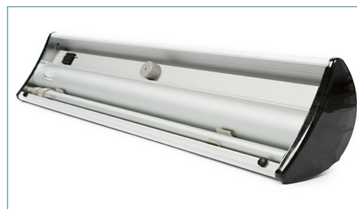
Integral Pole Storage in Base