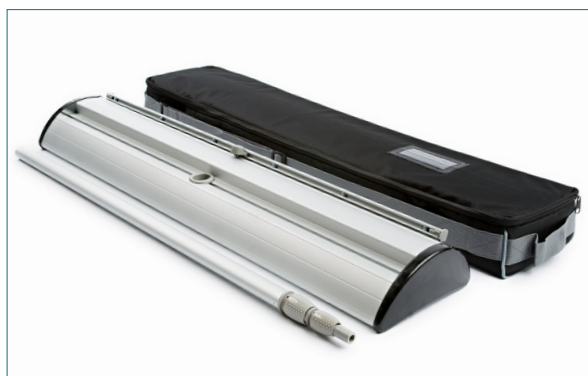
Padded case for carrying and storage